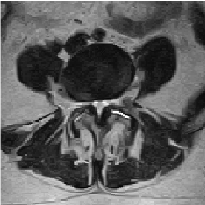
Axial view of the L4-L5 spinal segment. Figure 3.