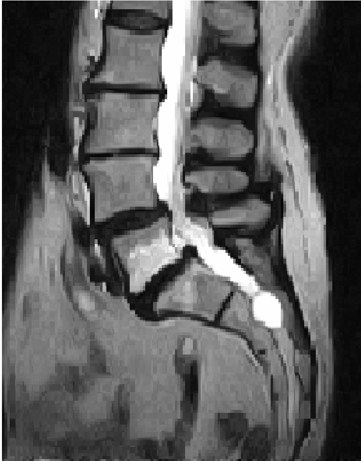
Sagittal view of the lumbar spine. Figure 1.

Degenerative spondylolisthesis at the L5 and L4 levels due to degenerative disc and facet disease. Advanced degenerative disc disease at the L2 and L3 levels of the lumbar spine.