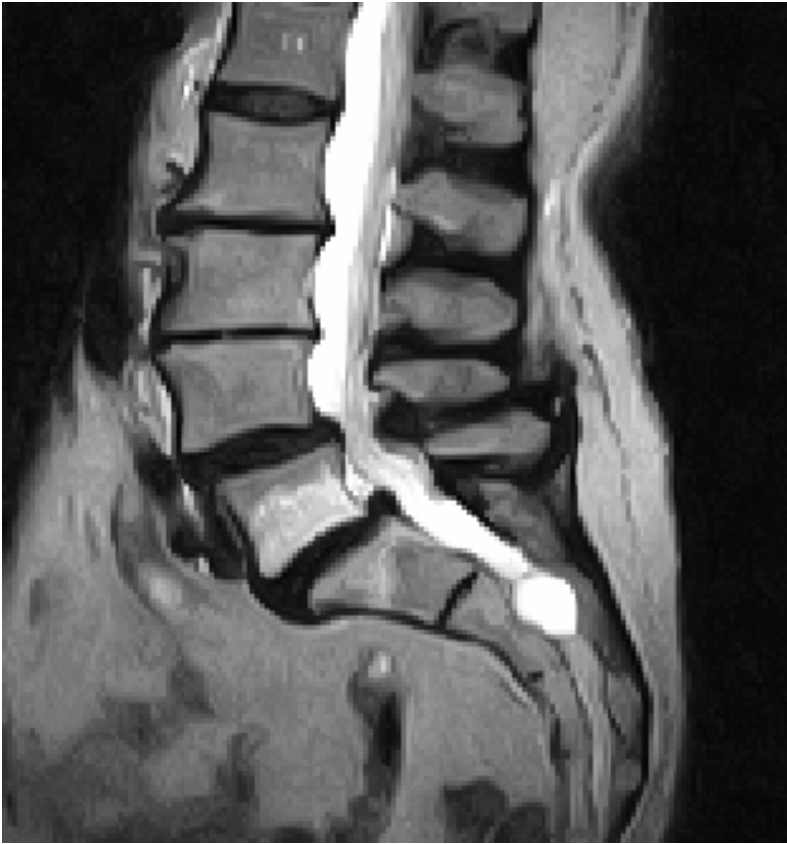
Sagittal view of the Lumbar spine. Figure 2.